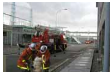
Photograph 3-2 Aspect of fire extinguishing activities