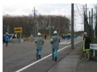
Photograph 3-4 Aspect of evacuation