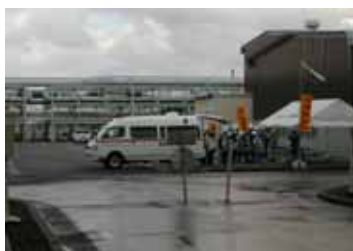
Photograph 3-3 Aspect of rescue activities(ambulance)