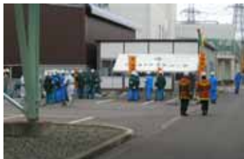
Photograph 3-1 The location of in-plant fire extinguishing activities

The switch-over from the former Disaster Protection System Manual to the Manual for Risk Management System has permitted training in conformity with actual circumstances at each plant and the reduction of the time from the start of training to its completion by about 15 minutes from the hypothetical time for conventional training. Photographs 3-1 to 3-4 show views of the disaster protection training.